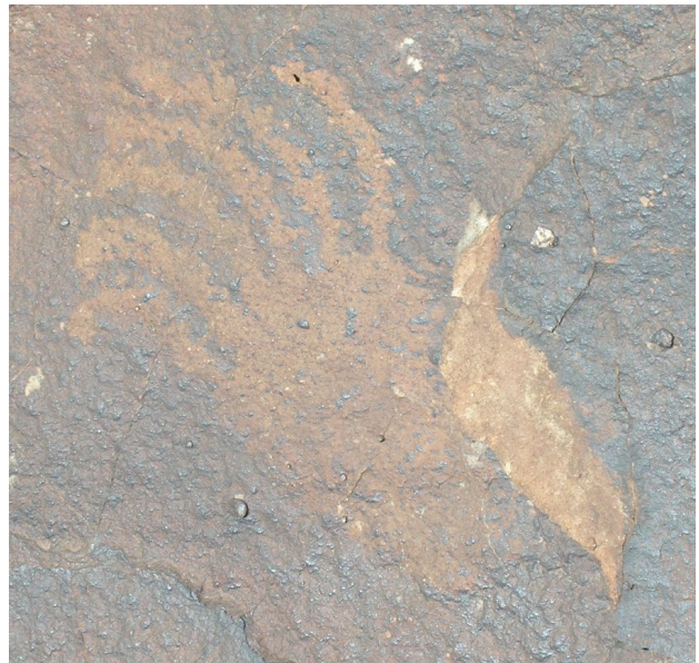
6-toed Bear Paw

The patina of the petroglyphs showed various stages of weathering indicating that this site had been in use by former inhabitants for perhaps thousands of years.