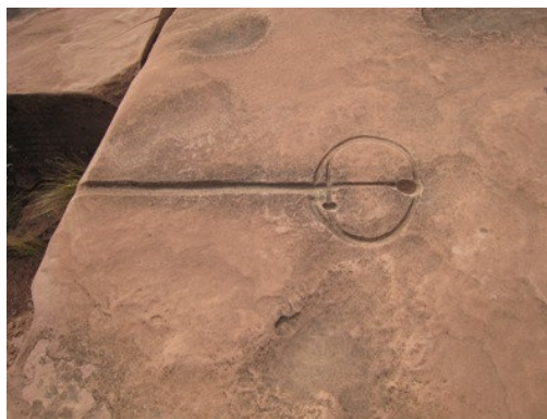
Water Glyph: One of the banjo glyphs discovered in the same area