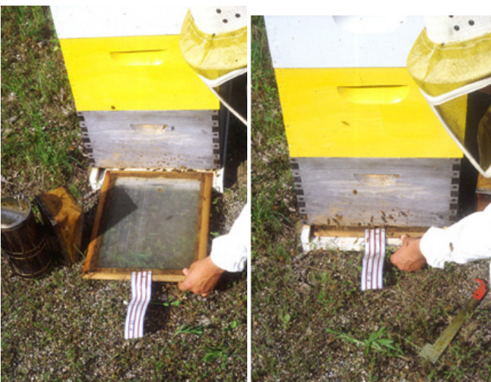
Figure 4. Inserting a “sticky board” to check the population of Varroa mites in a colony.

Some sticky boards are commercially available. To make your own sticky board, buy some 3/8 inch wooden door stop material, and make a frame that is almost as big as the hive bottom board but that can still fit into the hive entrance.