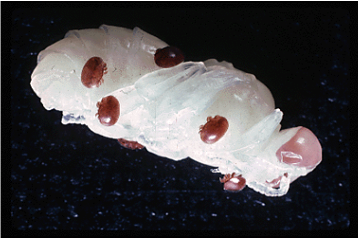
Figure 3. Drone pupa with adult mites on it. Drones can be recognized because they are larger in size and have larger eyes than workers. Varroa prefer drone cells over worker cells.

bees vigorously, and count the number of mites that stick to the sides of the glass. This method, sometimes called the “ether roll test,” is very fast, and gives you a rough idea of how many mites are present. If you see 15 or more mites in the sample, it is probably time to treat for mites (see Control). Varroa mite populations grow rapidly during the summer.