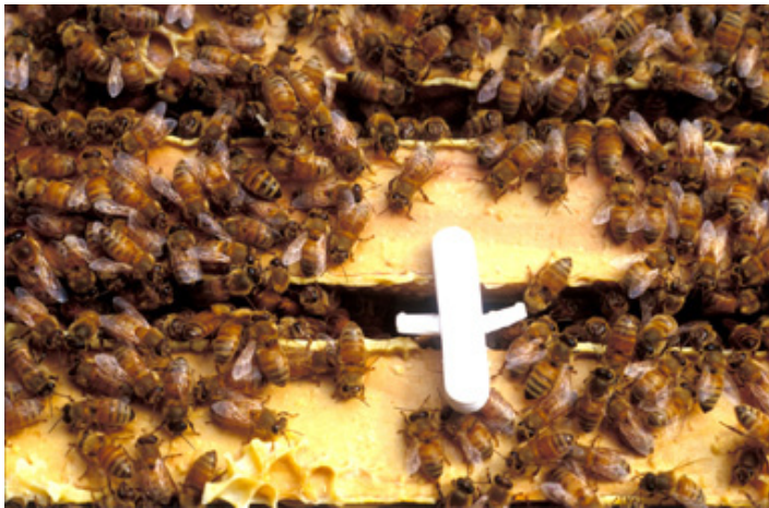
Figure 5. Checkmite strip hanging between frames. Notice how bees initially avoid the strip.

Relying on a single compound to kill mites has caused mites to become resistant to Apistan. To solve this problem, Checkmite strips containing coumaphos have been made available (Figure 5). These strips will work to control varroa mites even if they are resistant to Apistan and currently they are very effective. Be sure to use gloves because Coumaphos is an organo-phosphate (a nerve toxin). All of the cautions about not leaving Apistan strips in colonies when the honey supers are on also apply to Checkmite strips, but it is also illegal to harvest comb honey from a hive that had been treated with Coumaphos. Coumaphos can also harm developing queens. Never use checkmite strips in a colony that is rearing queens. The label states that maximum efficacy can be obtained by leaving strips in the colony for 42 days. However, to avoid excessive exposure of this pesticide to the bees and contamination of wax, consider leaving the strips in for just two weeks (the time that brood remains sealed), rather than the maximum time specified on the label.