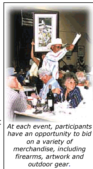
At each event, participants have an opportunity to bid on a variety of merchandise, including firearms, artwork and outdoor gear.