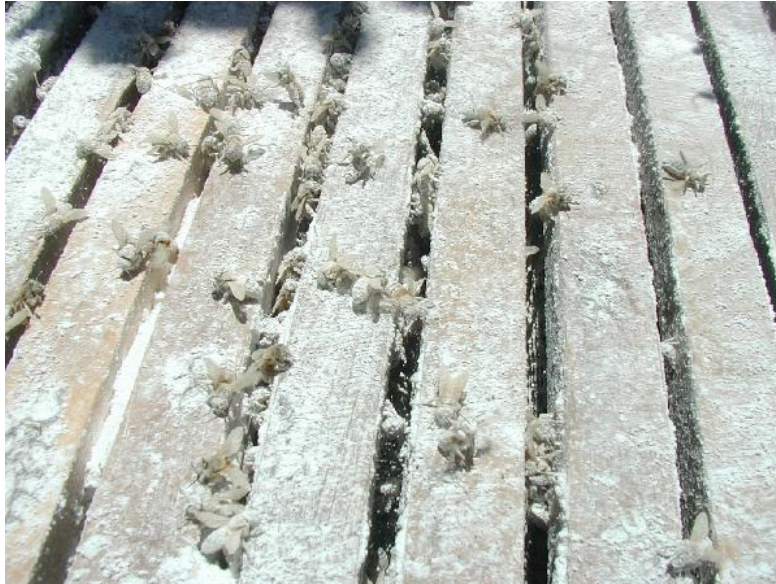
Bees become coated with powdered sugar.