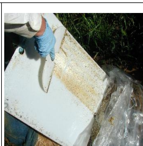
Scraping sugar and mites into a trash bag.