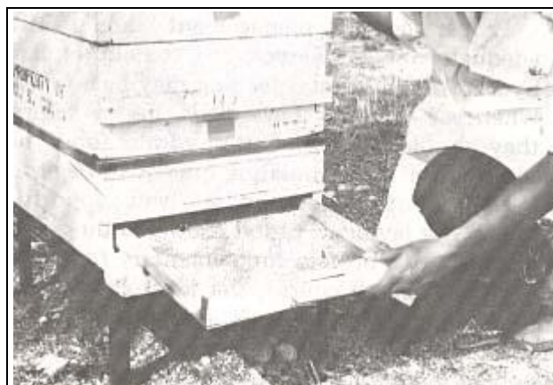
FIGURE 3. - Collecting trapped pollen pellets from a honey bee colony. Pollen trap collection tray is removed from back of hive.