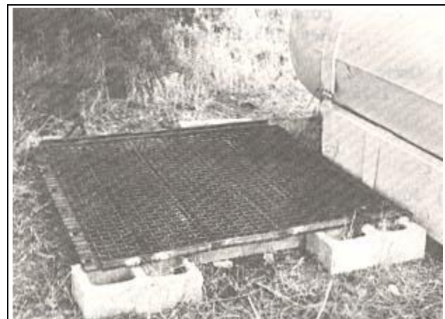
FIGURE 4. - Metal pan connected to a 1,000-gal tank with 1/4-inch tubing provides a constant supply of water for large numbers of bee colonies. Mechanical floats in pan regulate flow of water from tank. Excelsior on top of wood slats in pan helps prevent bees from drowning. Steel grid on top of pan protects water supply from large animals.

To prepare cane or beet sugar candy, mix one part granulated sucrose with one part water and heat this mixture until it becomes the thickness of fudge