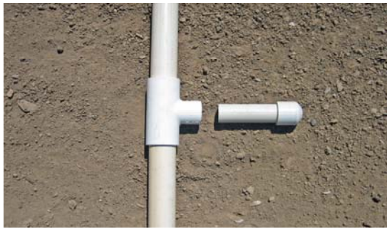
Plugs are used to restrict the water flow down the lines not being used