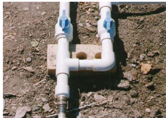
Flow rate is controlled by manual valves.

End caps are used on the end of each lateral line to force the water through the irrigation drip holes. Manual valves are used to control the flow rate. This system can be used for vegetable and flower gardens, trees, shrubs and other such areas.