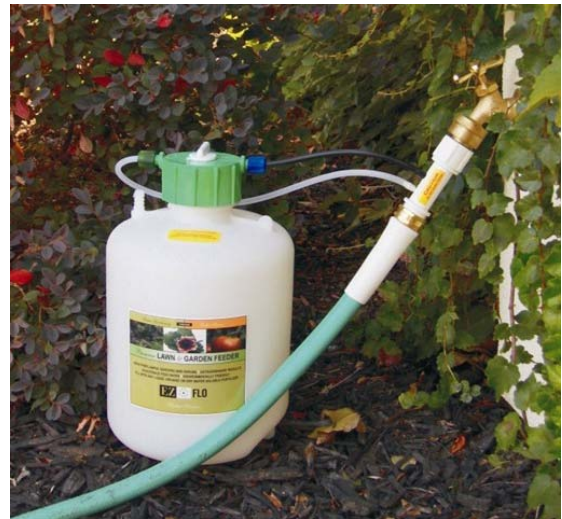
Fertilizer Injector 4

One of the essential elements of a successful garden is being able to meet the nutrient requirements of the plants during the season. The first step to creating a fertile garden soil is to determine current nutrient needs. Soil testing information is available at your local Extension office. There are different types of fertilizers available to the home gardener. These include both chemical and organic fertilizers. There are also different methods of applying fertilizers including injectors, foliar feeding, side dressing, banding and broadcasting. The Juab County Drip System can be used with most application methods, but the best results will be achieved by using some type of injector. Injectors can use either dry or liquid water-soluble fertilizer. By using an injector with this drip system, a gardener can control the quantity of fertilizer applied to meet the nutrient requirements of the different plants.