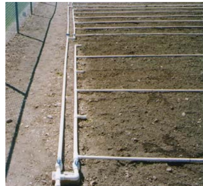
Main distribution line is glued, lateral lines are not glued

End caps are used on the end of each lateral line to force the water through the irrigation drip holes. Manual valves are used to control the flow rate. This system can be used for vegetable and flower gardens, trees, shrubs and other such areas.