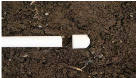
End cap on the end of each lateral line