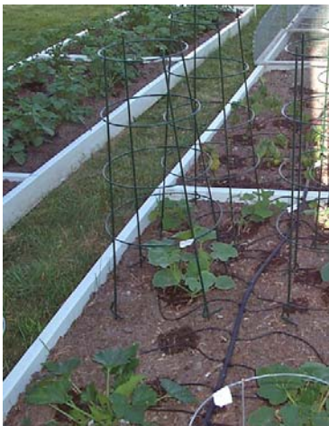
Raised bed with drip irrigation 3

There are different components that can be used in drip irrigation systems. These include the delivery system, filters, emitters, pressure regulators, valves or gauges, chemical injectors, pipes, tubing, and controllers. The use of these components will depend on the type of drip irrigation system used. There is no one right way to design a system. A person must judge for themselves the kind of system that would work best for them. Water cost, water availability, water quality, product and installation costs and maintenance skill level requirements are all factors to be considered when deciding which system to use.