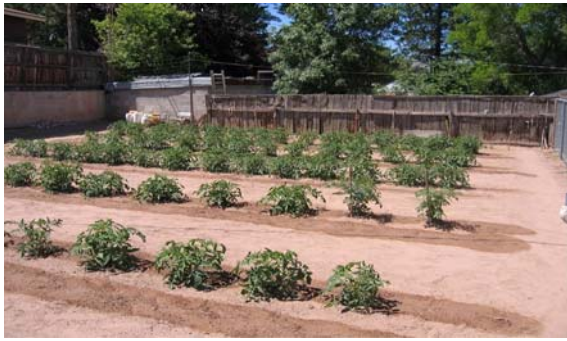
Underground drip irrigation 2