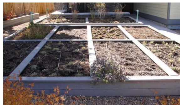
Raised bed using drip irrigation 1