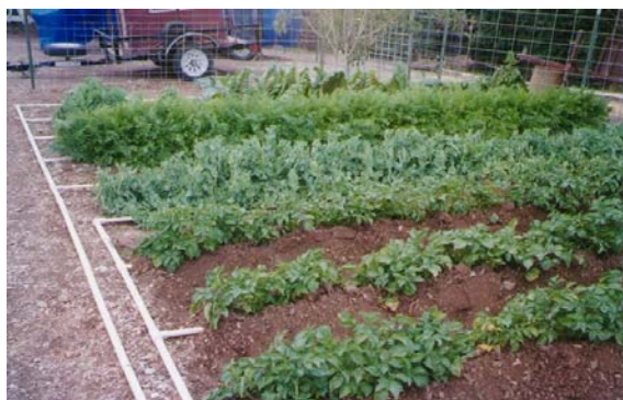
Jeff Banks Garden, Nephi, Utah

By using this system, users will enjoy several benefits. Water savings: in different studies home owners noticed water savings of 75-80%. Time savings: in the same studies, the participants experienced a 75-80% time savings in watering and weeding the gardens. Throughout the growing season, the study participants observed that the plants were healthier and produced at a higher level.